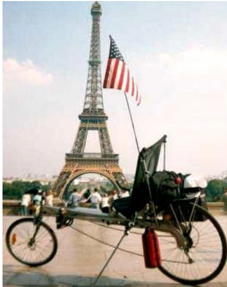
How would you get your recumbent to Paris?

If World travel is on your cycling agenda take a look at the Linear folder! Linear made the first recumbent bike that folded for airline travel in the early '80s. Why leave the comfort of a recumbent home and tolerate an uncomfortable bike on your dream trip?